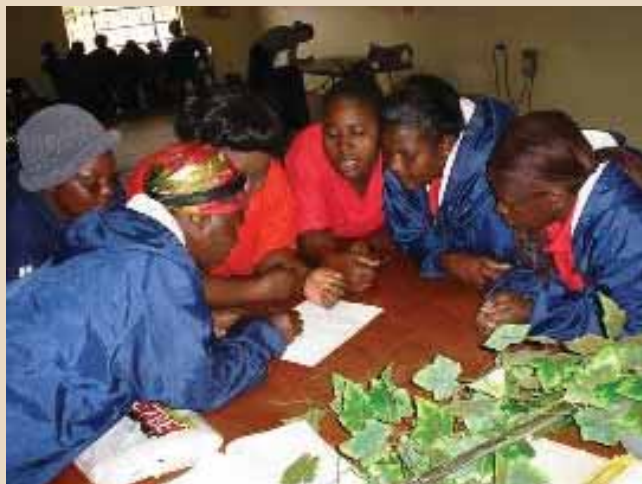
Photo 5: Group therapy volunteers at CHoiCe Trust, Mopani District in Limpopo.

As an African organisation committed to improving poorer people's livelihoods, we place great value on developing, demonstrating and sharing innovative approaches to address social inequality and poverty. Our learning and sharing work draws from our external and internal programmes to share with partners, as well as policy-makers and practitioners more widely. Khanya has always been involved in learning and sharing but only had dedicated staff from 2005, when a part-time service manager was appointed. We now have 2 full-time staff.