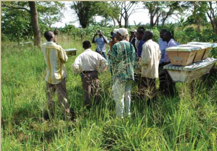
Photo 1: Community Forestry Advisors at the Queen Bee Centre in Luweero District

The core of our work is shown in Governance Issues 1 1 and 2 2 , which support communities to be active and involved in managing their own development, with services available to them at the community level. The objective of the practice is “An active and dynamic practice that develops and demonstrates approaches where communities are claiming their rights, exercising their responsibilities in driving their own development sustainably.” This requires community empowerment, supported by local governments and sectoral programs which provide services at the local level. Under this approach, local development is seen as a co-production of communities, local government and other sectors.