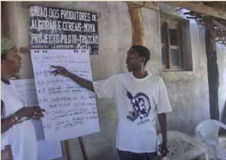
Photo 2: Smallholder cotton farmers prioritise programme interventions in support of agricultural based sustainable livelihoods in Moma District, Nampula Province, Mozambique.

The Rethinking Governance practice anchors Community-Driven Development (CDD) by demonstrating the interplay of state and citizen power in the development and management of policies, institutions and systems at all levels of governance. Key issues are state structures and operations, state legitimacy and capacity, and the role of civil society and citizen empowerment processes that give voice and choice to communities. The overall approach is to integrate governance issues across Khanya-aicdd's practices and services, develop and consolidate partnerships with relevant stakeholders from government, communities, civil society organizations, and private sector to support Community-driven Development (CDD).