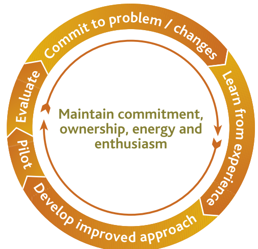
Figure 1: Khanya-aicdd's Action Learning Cycle