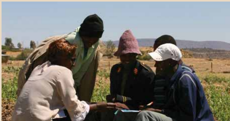
Photo 6: A group of women during a community consultation process

Capacity development takes place at individual, organisational, and societal levels, helping people and organizations to be more effective and have more impact. This requires an environment that puts people at the centre of capacity development, where people own the processes of development. If this happens then new insights and lessons can lead to sustainable development programmes, as people understand what is important for their own development, how to build on their assets by accessing external opportunities and how to mitigate their vulnerabilities.